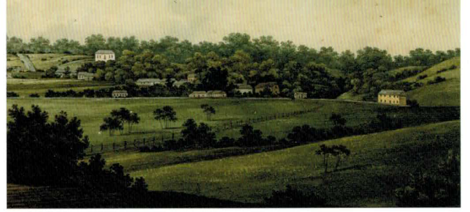
VIEW TO GOVERNMENT HOUSE ACROSS THE TOWN OF PARRAMATTA, c1809 [DETAIL] ARTIST UNKNOWN