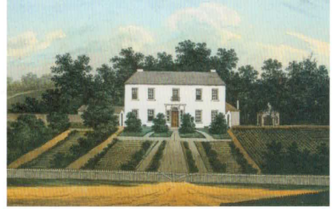
GOVERNMENT HOUSE, PARRAMATTA, c1805 [DETAIL] GEORGE EVANS

The Governor's role was to manage the convict system to achieve the survival of the colony. The work of the convicts at the Government Farm, Rose Hill was critical in ensuring the food supply. The sites of the earliest successful agriculture in New South Wales survive at the Crescent and the Government Farm, and are clearly visible within the Park landscape.