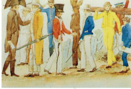
THE COSTUME OF THE AUSTRALIANS, c1817 EDWARD CLOSE STATE LIBRARY OF NSW