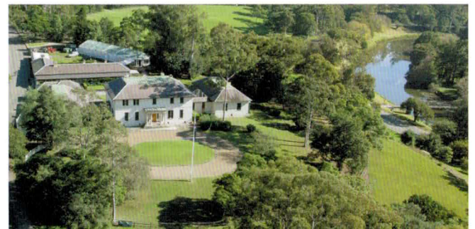
OLD GOVERNMENT HOUSE & DOMAIN, PARRAMATTA PARK PHOTOGRAPH 2009, SKYSHOTS

The World Heritage Listing recognises, at an international level, the authenticity and integrity of the landscape structure of Parramatta Park. It recognises the ability of the Park to illuminate the story of punishment by transportation and to document the management of convicts under the complex system of punishment and incentives implemented by successive early colonial governors.