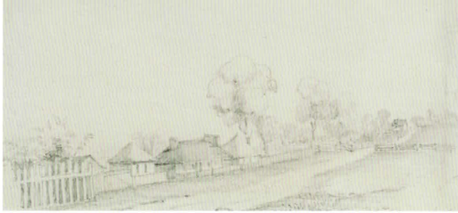
THE GOVERNMENT DAIRY, PARRAMATTA DOMAIN IN VIEWS OF PARRAMATTA , 1844 ARTIST UNKNOWN