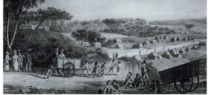
VIEW OF GOVERNMENT HOUSE AND SETTLEMENT OF PARRAMATTA, 1793 [DETAIL] FERNANDO BRAMBILA MUSEO NAVAL MADRID

It is thought that this mill continued to be operated by miller George Howell until c1818 when it was demolished under Governor Macquarie.