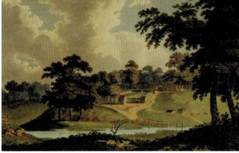
THE REDOUBT, c1791, EDWARD DAYES, AFTER JOHN HUNTER PUBLISHED IN AN HISTORICAL JOURNAL OF THE TRANSACTIONS AT PORT JACKSON AND NORFOLK ISLAND , LONDON, 1793