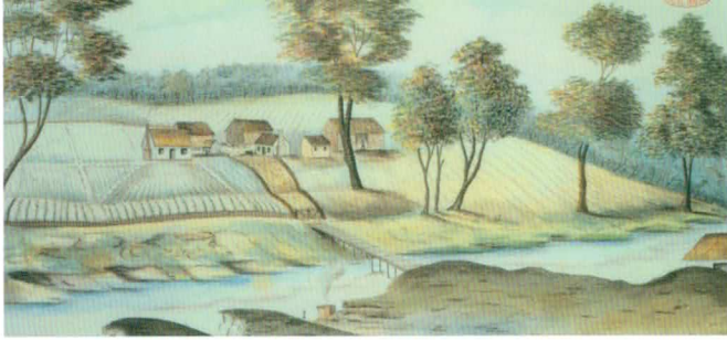
VIEW OF GOVERNMENT FARM AT ROSE HILL NSW, 1791 BY A PORT JACKSON PAINTER NATURAL HISTORY MUSEUM, LONDON